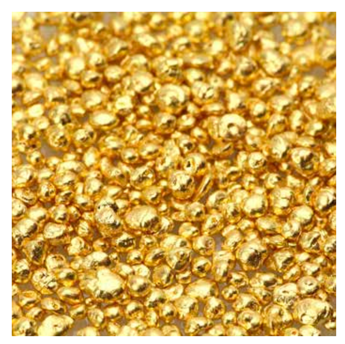
Thio-Gold <sup>®</sup> products provide a safer environmentally friendly alternative to cyanide lixiviants, which allows gold to be extracted from complex ore bodies and in turn extends the life of specific mines.